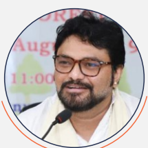
Sh. Babul Supriyo