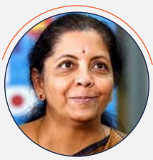
Smt. Nirmala Sitharaman