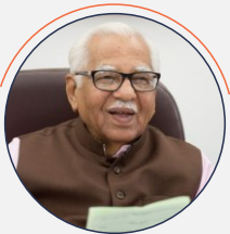
Sh. Hon. Ram Naik