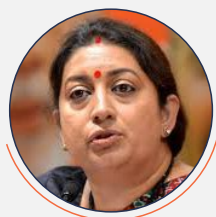
Smt. Smriti Irani