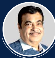
Sh. Nitin Gadkari