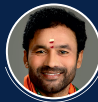
Shri G. Kishan Reddy