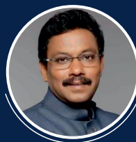
Shri Vinod Tawde