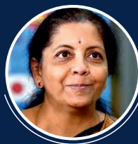
Smt. Nirmala Sitharama