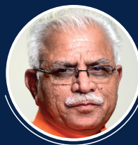
Sh. Manohar Lal Khattar